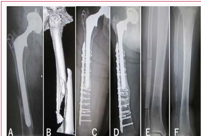
Figure 1: Radiographs and a CT image in a 74-year-old woman showed Vancouver type B1 fracture located distal to the femoral stem (A,B). Open reduction and internal fixation with plate and autogenous fibula graft were performed (C). Beta-TCP blocks with 75% porosity were placed on the periosteum (E). Marked bone formation around the fracture site was recognized 6 years after surgery (D). Partial reconstruction of fibula was found at 6 years (F).