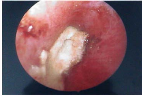
Figure 1: Otoscopic examination showing a whitish waxy material at the anteroinferior wall of the external auditory meatus and in contact with the tympanic membrane.