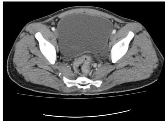
Figure 2: Pretreatment CT scan showing rectal cancer and prominent perirectal lymph node.

Our patient has a mutation not previously described in the MYH gene and the mutation is not routinely screened for in patients with polyposis. Here we describe a case with a mutation in MYH that