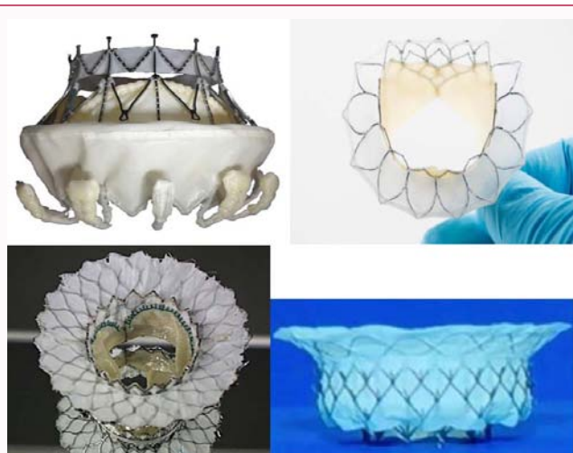
Figure 3: Novel Transcatheter Mitral Valves (Clockwise from Top Left): Edwards Lifesciences CardiAQ Valve Neovasc Inc. Tiara Valve Medtronic Twelve Intrepid Valve Abbott Tendyne Valve

The second patient was a 77 year-old female with history of bioprosthetic mitral valve replacement (#29 tissue valve) for rheumatic mitral regurgitation, tricuspid valve ring annuloplasty, CABG x2, biatrial cryomaze, and left atrial appendage ligation 18 months prior. She presented to an outside facility with recurrent NYHA Class III heart failure symptoms where cardiac catheterization showed patent grafts and a PA pressure of 70/25mmHg. Subsequently, she was transferred to our facility and was found to have severe eccentric mitral valvular regurgitation through the bioprosthetic valve with severe biventricular dysfunction. Her left ventricular ejection fraction was 30% without regional wall motion abnormalities. A malfunctioning and restricted leaflet resulting in severe eccentric mitral regurgitation was noted on the transesophageal echocardiogram. She was also felt to be inoperable. It was decided that she should be placed on transfemoral veno-arterial cardiopulmonary bypass for a short period intraoperatively as she would not likely tolerate rapid ventricular pacing required for valve placement and closure of the left