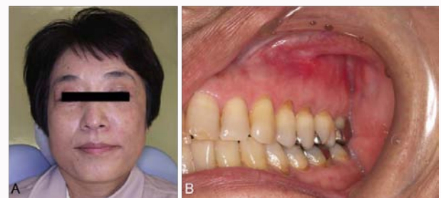
Figure 4: (A) Postoperative findings of the patient 3 months after surgery showing no evidence of swelling. (B) Intraoral photographs showing no fistula the healing of normal mucosa.

in the left cheek. Five months earlier, the patient underwent surgery to fit a Lactosorb® 1.5 resorbable fixation system (Lorenz Surgical, Jacksonville, FL, USA) to fix a zygomatic bone fracture at another general hospital. The patient never suffered any discomfort or presented any problems in the operative site before the fracture. Osteosynthesis was achieved by a fixation technique using three points along to the orbital rim, the frontozygomatic suture, and the zygomaticomaxillary buttress. During her first visit to the general dental practitioner, an intraoral examination revealed the presence of pus, discharged from the gingivobuccal area (Figure 1). Furthermore, a probe showed that the bone could be easily reached. A maxillofacial computed tomographic scan taken during the first visit showed as swelling of the soft tissue next to the left maxillary sinus and a maxillary sinusitis. In addition, the plate at the zygomaticomaxillary buttress showed bone resorption surrounding the plate and the screws (Figure 2).