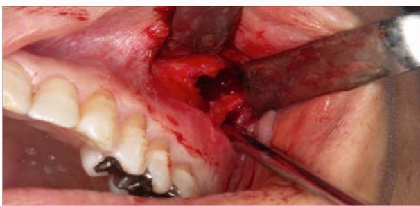
Figure 3: Bone resorption surrounding the extracted plate continued toward the maxillary sinus.