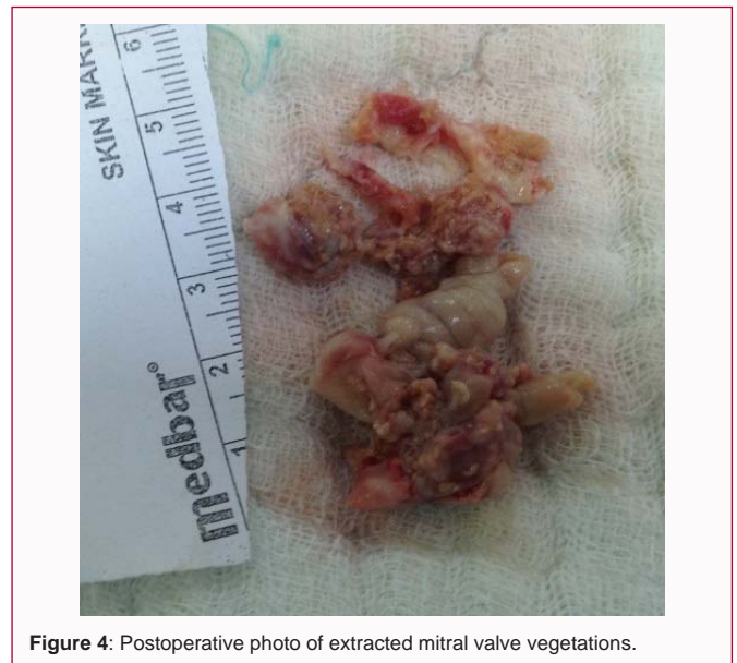
Figure 4: Postoperative photo of extracted mitral valve vegetations.

The results of microbiological study was reported as Gram positive bacteria ( Staphylococcus epidermidis ) and recommended antibiotic therapy was started as vancomycin, gentamicin intravenously and rifampicin orally because the patient was working at medical disposal facility. Three-weeks later from the left lower extremity embolectomy operation there was some swelling and hemorrhagic drainage from the previous incision area at the left femoral region in the groin, then pseudoaneurysm was detected. The operation was planned under local anesthesia with the opening of previous surgical site. It was observed that approximately 5 x 8 cm sized ruptured, mycotic aneurysm in the left femoral artery. The artery was exposed and femoral embolectomy was performed proximally and distally, and continuity of circulation was maintained. The lumen of the artery was filled by fibrin and exudative material due to the nature of the mycotic aneurysm. Then the arterial defect was repaired with ipsilateral