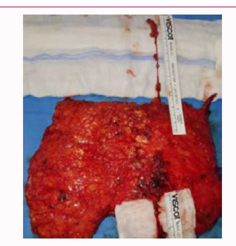
Figure 2: Deep side of the flap. In the lower part of the picture, there is the deep inferior epigastric pedicle. In the upper part of the picture, there is the SIEV ipsilateral (to the pedicle of the flap to be anastomosed) anastomosed to the graft of the contralateral SIEV- total length of 11.5 cm.