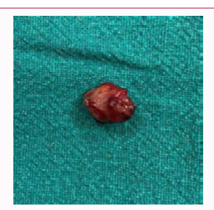
Figure 3: Post surgery gross appendiceal stump.

A long ( \geq 2 cm) stump from laparoscopic appendectomy and retained appendicolith in an adult patients have prevalence of recurrent obstruction and inflammation. Generally, an appendix stump shorter than <5 mm reduces the risk of stump appendicitis [6]. It has been suggested that appendicular stump longer than 3 mm should not be left behind during surgery [5]. Longer stump may result in chronic inflammation or a reservoir for fecalith, & prone to inflammation. Appendiceal stump lengths are reported to range from 5 mm to 5.1 cm [7,8]. Perforation of stump at presentation