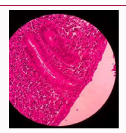
Figure 4: Microscopic appearance of stump appendix.

ranges from 16% to 30%, and increased by a delay in diagnosis or with atypical presentation & in older patients [6]. The lifetime risk of developing appendicitis is 8.6% for men and 6.7% for women [9].