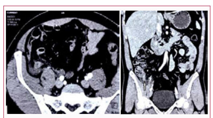
Figure 2: Contrast-enhanced axial and coronal CT of abdomen shows wall enhancing enlarged Appendiceal stump (arrow) with fat stranding.

well as enhancing wall 8 mm in diameter & 9 mm long stump (Figure 2) tubular structure with history of laparoscopic appendectomy 5 months ago was diagnosed stump appendicitis with perforation. The patient underwent surgery and post-surgery found perforated appendicle stump with appendicolith. The stump was approximately 9 mm long (Figure 3). Histopathological examination of the operated stump confirmed the presence of a stump appendix with inflammation of appendix & surrounding adjacent tissue (Figure 4). Some reports have suggested that laparoscopic appendectomy is associated with an increased incidence of stump appendicitis when compared with open appendectomy [5].