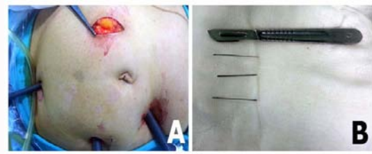
Figure 2: (A) Trocar placement and subcutaneous sewing needle removal incision with the needle showing on the tip of the surgical instrument. (B) The removed needles.

In a case of not-localized intraperitoneal foreign body, the patient can be an appropriate candidate for open surgery, or in selected patients a laparoscopic approach may be preferable [5,6]. In the present case, one subcutaneous and two intraperitoneal, non-ingested, forcefully inserted and not-precisely localized sewing needles were managed laparoscopically and through local exploration of the skin. This case is interesting by, no intra-abdominal organ injury despite the migration route, mechanism and used technique to facilitate needle removal. Sociocultural factors or co-existing psychiatric disorders of the patients may result in different clinical manifestations and this may result in some challenges in daily emergency practice. In our opinion, appropriate radiological evaluation guided laparoscopic exploration has the advantage of magnified sight, which can be helpful in finding non-localized, intra-abdominal foreign bodies, and when the object is stuck in the momentum, an omentectomy can be a safe and feasible option under fluoroscopic examination.