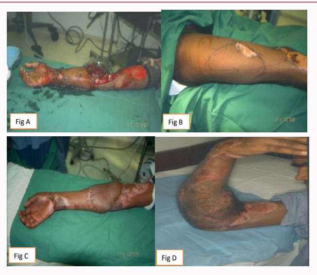
Figure 3: 24 years old gentleman met a road traffic accident and the wheel of a bus ran over his arm with crushing of elbow and almost an amputation. Following fixation of supracondylar fracture of humerus and restoration of circulation with vein grafts in both ateries and veins, he had necrosis of skin on anterior aspect of elbow, arm and forearm, that was reconstructed with lateral arm flap. Fig A shows patient presentation in the emergency room after 6 hours of injury. Fig B shows peroperative marking of flap at Donor site. Fig C and D show functional outcome.

The free lateral thigh flap is based on the third perforator profunda femoral artery. This perforator gives a large cutaneous branch to the skin of the lateral and posterior aspect of thigh. Although the origin