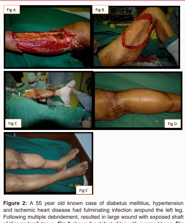
and ischemic heart disease had fulminating infection aropund the left leg. Following multiple debridement, resulted in large wound with exposed shaft of tibia and soft tissue. Fig A shows the defect of leg with exposed bone. Fig B shows peroperative dissection of flap. Fig C shows coverage of defect with lateral thigh flap immedately after anastomosis. Fig D and E show long term result of lateral thigh flap for leg defect.

Figure 1: A 16 year old boy who underwent forequarter amputation of right upper limb due to stage III Ewing sarcoma of proximal humerus. Fig A showing per-operative dissection of lateral thigh flap with attached vessels. Fig B shows per-operative picture following anastomosis and attachment of flap at recipient site. Fig C shows recipient site after six weeks and Fig D shows recipient site with skin graft.