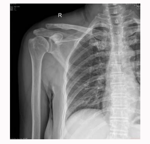
Figure 4: Removal of internal fixation device 6 months after surgery, and no second AC dislocation was seen.

Thirteen AC dislocation patients consulted in our hospital and received MSTC combined with AO metacarpal plate surgical treatment from June 2016 to April 2017 (Table 1). All surgeries were completed by an experienced surgeon. All patients were followed for at least 12 months with clinical condition and radiographic images (Figure 3). The male-to-female ratio among the 13 patients was 8:5, including 3 Roockwood type III patients and 10 Roockwood type V patients. Meanwhile, 8 of them had right AC dislocation, while 5 had left AC dislocation. The average injury-to-surgery interval was 3.6