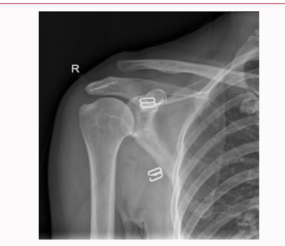
Figure 1: A X-ray in anteroposterior view of a right shoulder with an ACJ injury Rockwood Grade III.

A 65-year-old women was knocked down by a motorbike 2 h ago, and her right shoulder touched the ground, which led to right shoulder pain and swelling. The patient thus visited the Orthopedics Emergency in our hospital. Physical examination: obvious AC joint tenderness, "key sign" positive, Limitation of Range (LOM) of right shoulder joint, no paresthesia in right hand and right forearm, right radial arterial pulsation was palpable, and favorable blood circulation was seen in right upper extremity. Right shoulder joint X-ray films revealed right AC dislocation, with the AC joint space of about 9 mm (Figure 1). The patient was given preoperative detumescence (mannitol, 100 ml, intravenous infusion, once/day) and analgesia (celecoxib, 0.2 g, oral administration, once/day) symptomatic treatment. The patient was diagnosed with right AC dislocation (Rockwood III) and was proposed to undergo MSTC combined with