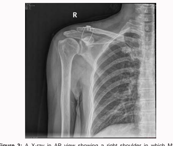
Figure 3: A X-ray in AP view showing a right shoulder in which MSTC combined with AO metacarpal plate was performed.

twice/day) was administered to prevent infection, along with preventive analgesia (celecoxib, 0.2 g, oral administration, once/ day), and detumescence (mannitol, 100 ml, intravenous infusion, once/day). The neck-wrist brace was used for 4 weeks. The functional rehabilitation could be divided into 3 stages: (1) 0 to 4 weeks after surgery, active movements of hand, wrist and elbow joints were conducted within 24 h after surgery based on the pain tolerance degree of patients. Meanwhile, small-range passive rotatory movements of the shoulder joint were also encouraged. (2) 5 to 6 weeks after surgery, the neck-wrist brace was removed and painless shoulder joint ranges of motion exercises were carried out. (3) After 6 weeks after surgery, painless full-range activities of the affected shoulder were encouraged, along with gradual strengthening exercise. The functional results, imaging results and complications were recorded in the last follow-up.