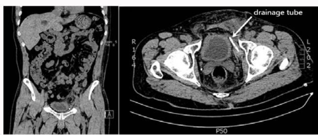
Figure 2: These images show no hematoma after surgical intervention and a tube placed in preperitoneal space (white arrow).

the urethral catheter. We believed that violent drag of bladder induced more rupture of the artery. Compared with Lichtenstein technique, UHS method is a relatively difficult technique for young hernia surgeon. Unlike laparoscopic hernia repair, the blunt dissection of the preperitoneal space in UHS technique is finished under indirect vision which may cause vascular damage. The most commonly known vascular damage are those of the epigastric vessels those of the iliac veins and corona mortis. These damages usually cause a small preperitoneal hematoma which is not required clinical intervention and would be absorbed in 3 to 4 weeks with conservative therapy. In some cases, hematoma may induce infection in long term which may need for drainage or reoperation.