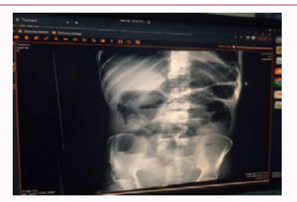
Figure 1: Erect abdominal X-ray with dilated small bowel loops and multiple air-fluid levels.

Based on the above findings with presumed diagnosis of generalized peritonitis secondary to Strangulated SBO secondary to small bowel volvulus, exploratory laparotomy was decided and the patient resuscitated by 3 bags of normal saline. NG tube was inserted, broad spectrum parenteral antibiotics was started. Lastly with preoperative vital signs of BP=110/60, PR=102 bpm, RR=23 br/ min, Spo2=96%, UOP =200 ml/1h, anesthesia team was consulted for preoperative anesthesia evaluation and evaluated then taken to OR. Under general anesthesia the patient abdomen has been opened via the midline incision. Upon entry to the general peritoneal cavity there was offensive dark hemorrhagic fluid estimated to be 800 ml. There were dilated small bowel loops and gangrenous segment was at the distal ileum near to Ileocecal Junction (ICJ) with ileo-ileal knotting causing closed loop strangulated obstruction (Figure 2). Then the knotted bowel was tried to be unraveled but it was difficult. Later it was found that ligating and resecting the gangrenous bowel mesenteric vessels was accessible for proximal resection of the gangrenous part of the bowel loops and controlled decompression was done. Then after decompression the bowel ends tied and this enables to unravel and exposed the distal end of the gangrenous segment which also has been resected. The distal aspect of the bowel was near the ICJ which