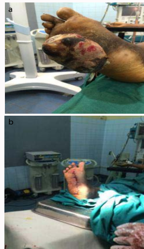
Figure 1: (a) preoperative. (b) postoperative.

article distributed under the Creative Commons Attribution License, which permits unrestricted use, distribution, and reproduction in any medium, provided the original work is properly cited.