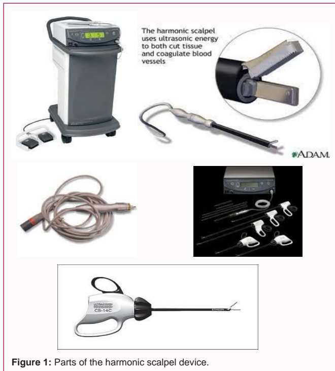
Figure 1: Parts of the harmonic scalpel device.

diathermy Milligan and Morgan excision it has been demonstrated to improve significantly postoperative pain, bleeding and, therefore, in-hospital stay compared to Milligan-and Morgan, besides it has a fast learning curve [13]. The benefits mentioned above makes the operation easier, safer and quicker which justify the increased price of ultrasonic device compared to the diathermy [13]. Ultrasonic Coagulation and Cutting Devices use energy generated from ultrasonic vibration. Ultrasonic energy is an efficient alternative to electro surgery. The device cuts and coagulates by using much lower temperatures than those produced by traditional diathermy or lasers. Moreover, no electricity goes to or through the patient [14]. The ultrasonically activated scalpel (UAS) has the benefit of its ability to cut and coagulate tissues simultaneously with relatively limited lateral thermal injury. The UAS has been used in laparoscopic surgeries and open surgeries of the lung and liver [14].