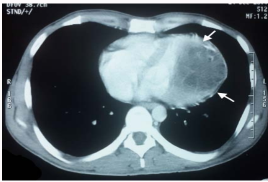
Figure 2: Chest CT scan showing a massive cardiac hydatid cyst of the left ventricle.

computed tomography showed a myocardial multi-vesicular cystic mass with calcifications (Figure 2). Surgical exploration with cardiopulmonary bypass had uncovered a hydatid cyst ruptured into the left ventricle with the presence of free vesicles. The postoperative course was marked by the appearance of an array of severe respiratory distress that led to patient's death on 5th postoperative day despite resuscitative measures in the intensive care unit.